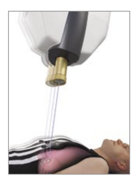
The patient breathes normally while the system delivers pencil thin accurate beams to the moving target.